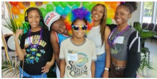
Sincere: Reproductive Health Care Worker 50.5x R.O.I.

Her company's flexible work mode option and child care credits let this mom of two expand the scope of her important role, limit absences, and co-lead an ERG.